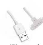
USB magnetic charging cable