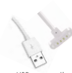
USB magnetic charging cable